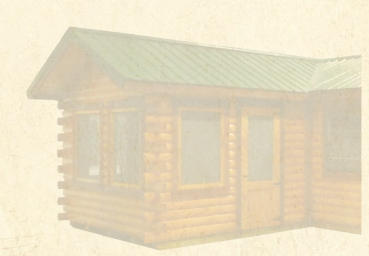
QUALITY, AFFORDABLE LOG CABINS BY